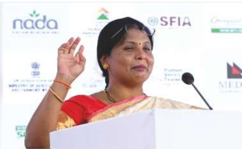
Hon. Sushma Andhare Upneta, Shivsena (Uddhav Balasaheb Thakre)