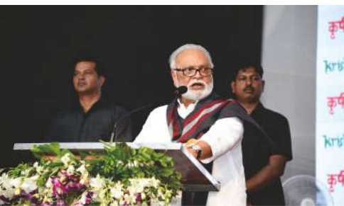
Hon. Shri. Chhagan Bhujbal Former Food & Civil Supply & Consumer Affairs & MLA