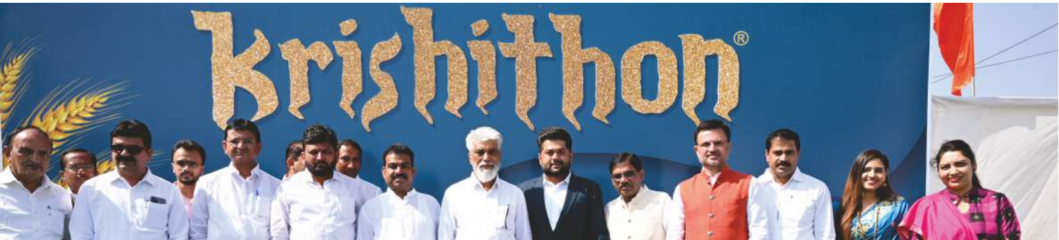
Hon. Shri. Dada Bhuse - Minister of Ports & Mining, Government of Maharashtra & Guardian Minister of Nashik along with NADA Officials