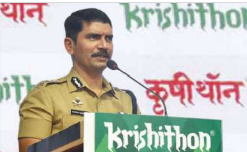
Shri Vishwas Nangare Patil , IPS at Youth In Agriculture Summit