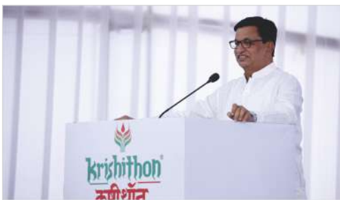
Hon. Shri. Balasaheb Thorat Former Revenue & Agriculture Minister & MLA