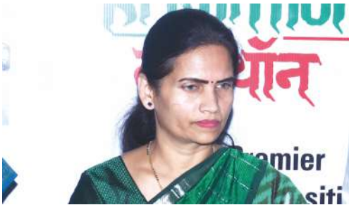
Hon. Smt. Bharati Pawar MOS for Health and Family Welfare - Government of India