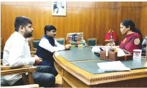
Hon. Smt. Nirmala Sitharaman - Union Minister for Finance Shri. Hemant Godse - MP, Nashik