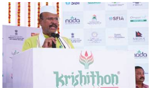
Hon. Shri Abdul Sattar Agriculture Minister, Government of Maharashtra