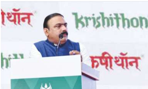
Shri Makarnad Anaspure Actor and Social Activist