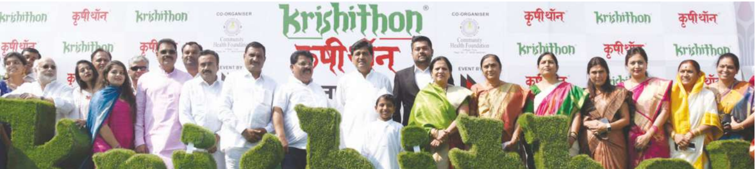
Hon. Shri. Ashokrao Chavan - Former Chief Minister of Maharashtra