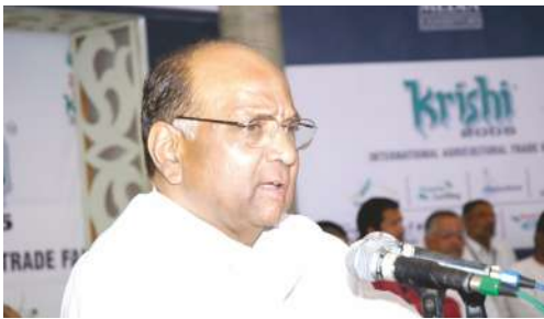
Hon. Shri. Sharadrao Pawar Former Union Minister for Agriculture